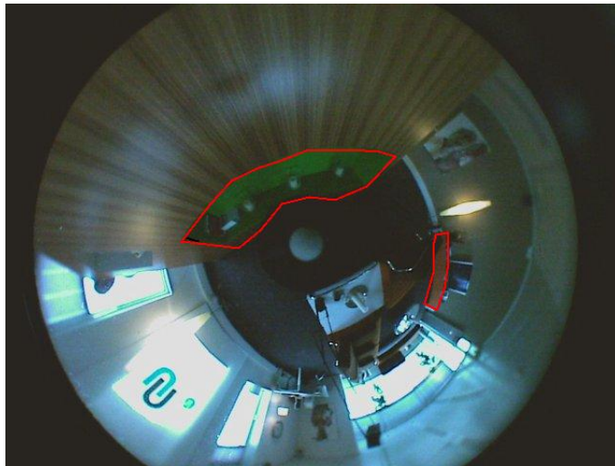
(a) Living room